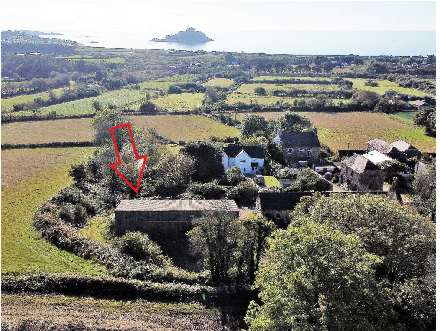
The Pack House